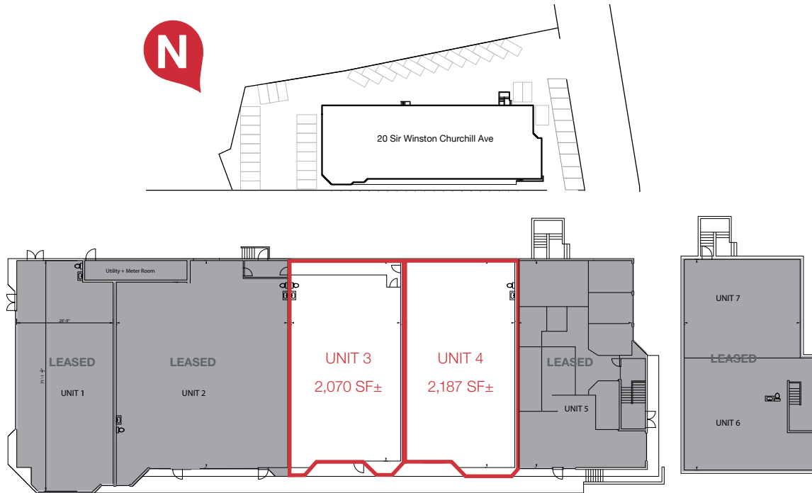
FOR ILLUSTRATIVE PURPOSES - MAY NOT BE EXACT